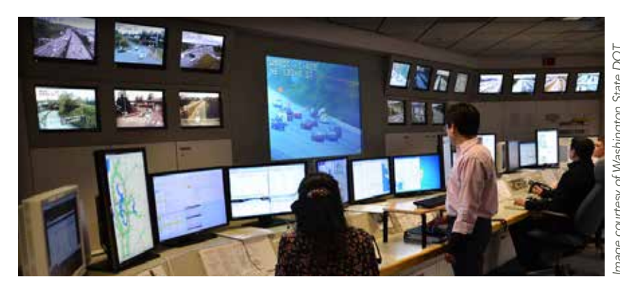
Technological advances will lead to an increase in data collected in the future. DOTs must develop plans for how they will use, store and manage this data.

While specific experiences varied from state to state, the scan team noted common themes across all of the presenting agencies. For instance, as technology evolves, the demand for employees with the necessary skills to use and understand it increases. Therefore, the strategies that worked in the past to attract and retain workers may need to be reevaluated in order to accommodate the changing workforce. The scan team members compiled their findings into a list of recommendations that address each of the scan's six topics.