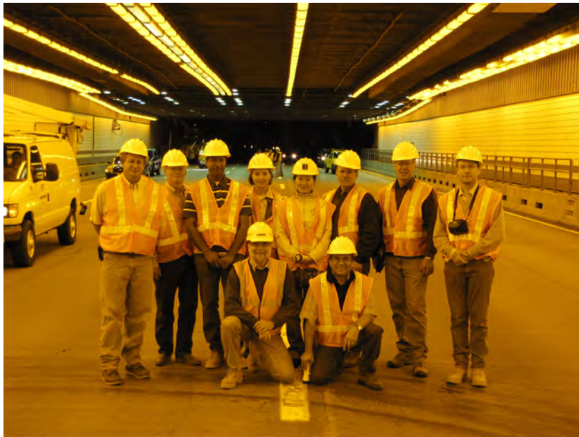
Figure 1.8 Scan team members in Central Artery Tunnel during MassDOT overnight maintenance closure

The nine member scan team consisted of two representatives from FHWA, five representatives from state DOTs, an academic member representing the TRB's AFF60, and the report facilitator (see Figure 1.8). Contact information and biographical sketches are given in Appendix F and Appendix G, respectively.