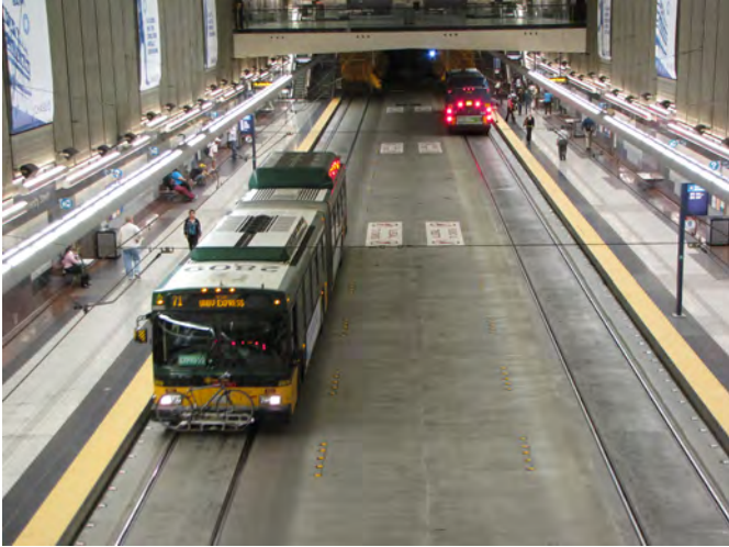
Figure 1.7A Downtown Seattle transit station