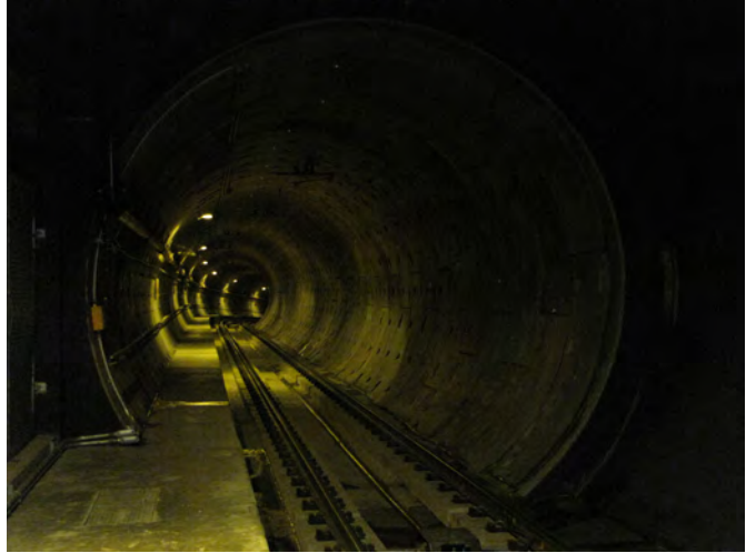
Figure 1.7B Sound Transit Tunnel