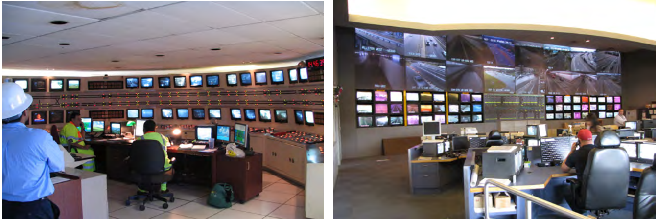
Figure 2.2 Integrated operations control centers

AKDOT&PF: Only the operations system and traffic control are integrated. The support systems send signals that they are functioning or not, but they cannot be controlled from the operations panel. The fan monitoring system is standalone.