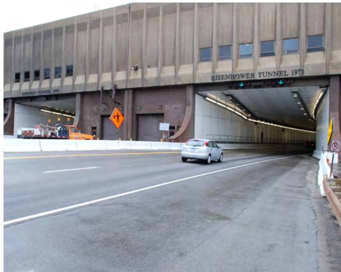
Figure 1.3 Eisenhower/Johnson Memorial Tunnel on I-70 in Colorado

Opened in 1992, the HLT on I-70 at the midpoint of Glenwood Canyon is 4,000 feet long and consists of two separate two-lane bores with a connecting cut-and-cover section. Each bore carries unidirectional traffic 12 . The tunnel is one of the most technologically advanced tunnel systems in the country. Inside the tunnel is a traffic control and information center that tracks each vehicle traveling through the tunnel via an incident detection and traffic management system of sensors and closed circuit television (CCTV) cameras. A fleet of emergency vehicles is stationed in the middle of the tunnel for 24-hour-a-day response capability, and refuge areas are coordinated with cross-passages. In 2002, a rockslide on the cut-and-cover part of the tunnel cracked the eastbound liner, causing the bore to be closed for repairs when the crack widened in 2007.