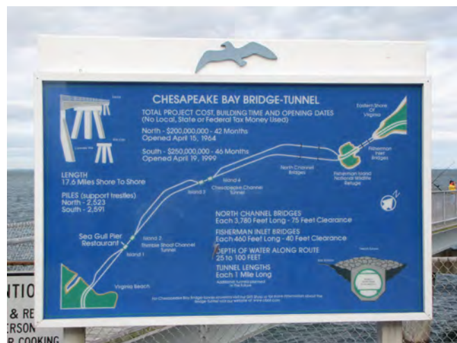
Figure 1.4 Chesapeake Bay Bridge-Tunnel

The Chesapeake Bay Bridge and Tunnel (CBBT) District owns and operates the CBBT, which opened in 1964 16 . The CBBT consists of over 12 miles of low level trestle, two one-mile bi-directional tunnels, two bridges, almost 2 miles of causeway, and four manmade islands, totaling 17.6 miles from shore to shore plus 5.5 miles of approach roads as shown in Figure 1.4. It connects Southeastern Virginia and the Delmarva Peninsula (Delaware and the Eastern Shore