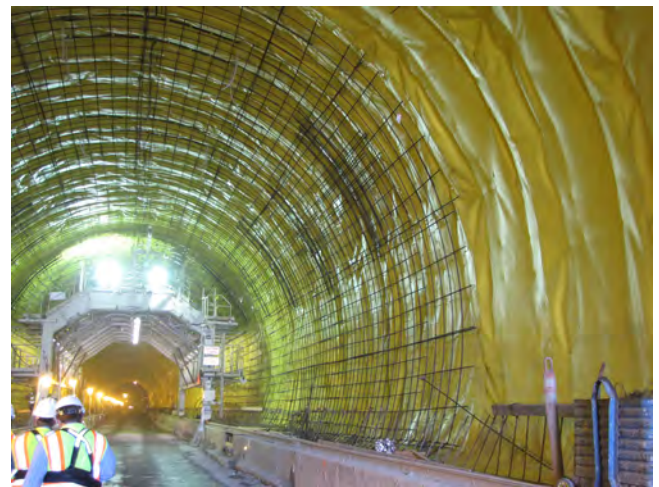
Figure 1.2 Devil’s Slide Tunnel under construction on Route 1 near San Francisco