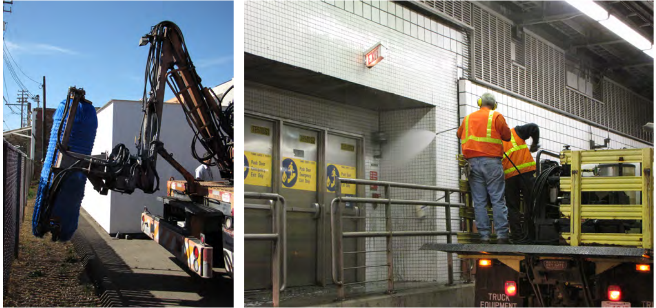
Figure 2.1 Examples of equipment used to wash tunnel walls

Caltrans: Caltrans does not have a predetermined wash schedule. Washing is done on an as needed basis, on demand, or as a result of complaints.