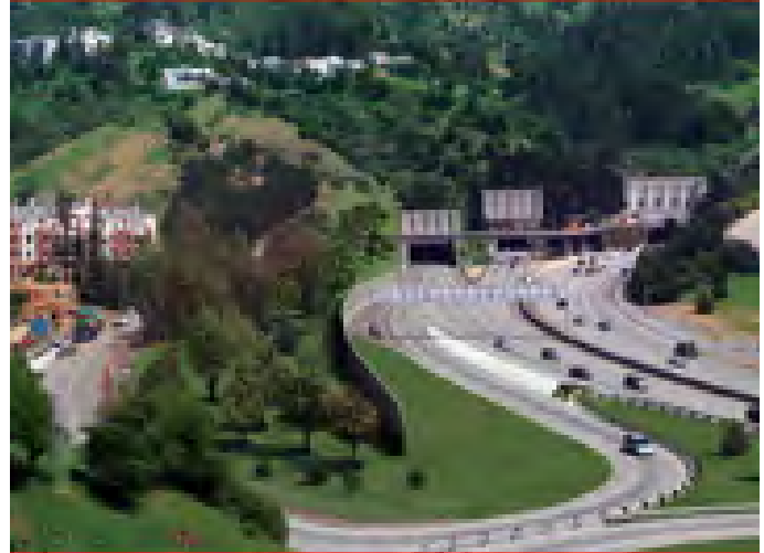
Figure 1.1 Fourth two-lane Caldecott Tunnel bore on SR-24 under construction

The EJMT is a twin-bore tunnel 60 miles west of Denver 11 . The westbound bore opened to two-way traffic in 1973. Once the eastbound bore opened in 1979, each bore then carried one way traffic. At 11,000 feet, the 1.7-mile tunnel is the highest elevation for a vehicular tunnel in the world. The tunnels are approximately 115 feet apart at the east entrance and 120 feet apart at the west entrance. The exhaust ducts and air supply ducts are located above a suspended porcelain enamel panel ceiling. A